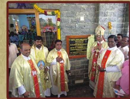
BLESSING & OPENING OF NEW CHURCH, SILUVAIPALAYAM KRISHNANKUPPAM