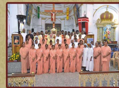
FINAL VOWS, FIHM