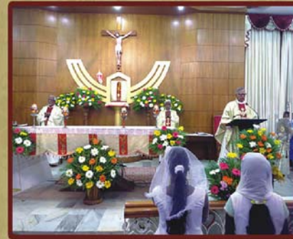
FEAST MASS, VINOBA NAGAR