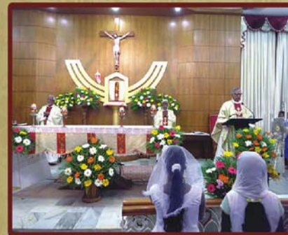
FEAST MASS, VINOBA NAGAR