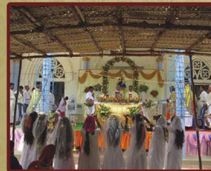
GOLDEN JUBILEE MASS, MAMALUR