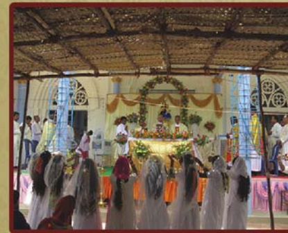
GOLDEN JUBILEE MASS, MAMALUR