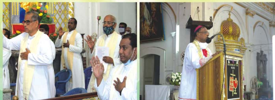
"RECOLLECTION & CHRISM MASS CELEBRATION ON 29 MARCH 2021