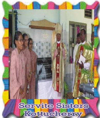
Servite Sisters Kottucherry