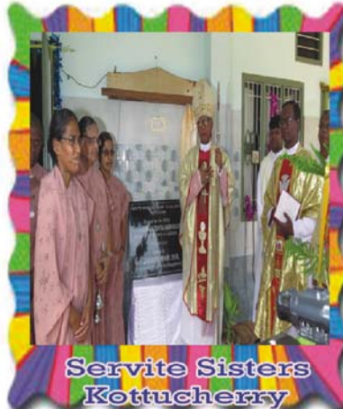
Servite Sisters Kottucherry