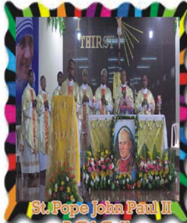
St. Pope John Paul II B.Ed College