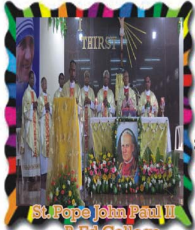
St. Pope John Paul II B.Ed College