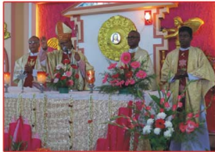
Feast Mass, Kalpet