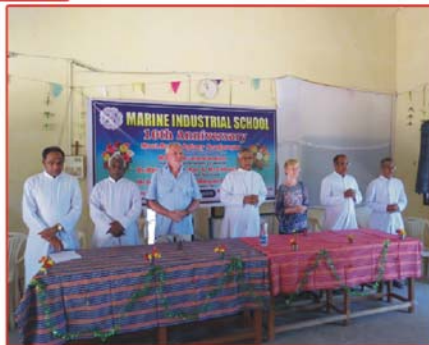
Marine Industrial School, 10th Anniversary