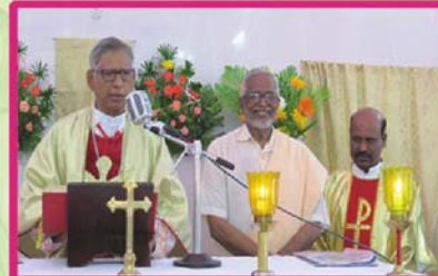
FEAST MASS, BAHOUR