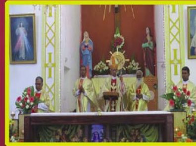
FEAST MASS, RAINBOW NAGAR