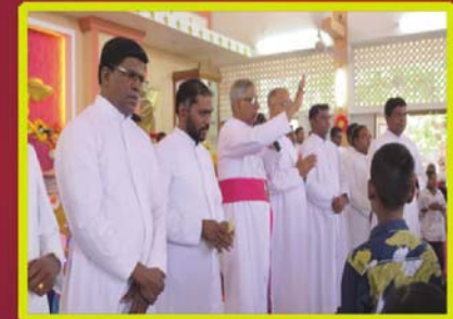
FEAST MASS, KALPET