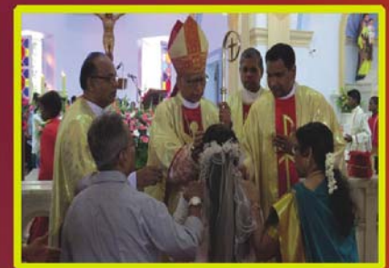
CONFIRMATION, N.D. DES ANGES