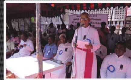
BLACK DAY PUBLIC MEETING, PONDICHERRY