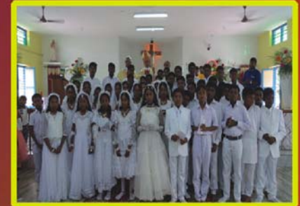
FEAST MASS, MARAKANAM