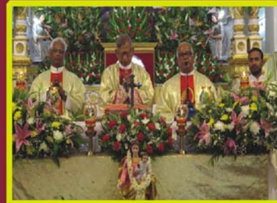
FEAST MASS, NELLITHOPE