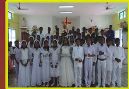
FEAST MASS, MARAKANAM