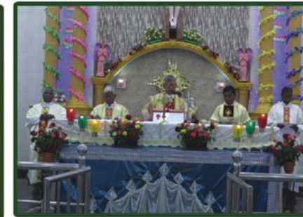
Erection of New Parish Seppakkam