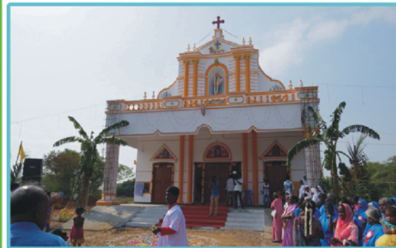
Blessing of Punitha Sagaya Matha Church Peria Nolambai