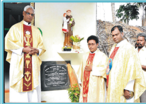
Blessing of New Infant Jesus Church, Odathangal, Velanhangal