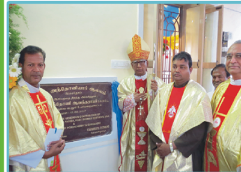
Blessing of New Church of St. Antony Bramadesam, Narasinganur