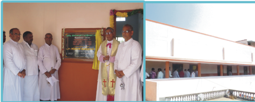
Blessing of School Building, Irudayampattu